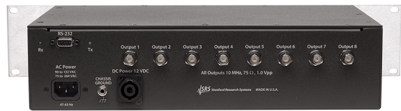
PERF10 rear panel