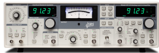
SR124 front panel