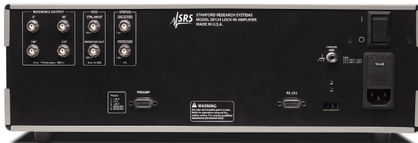
SR124 & SR2124 rear panel