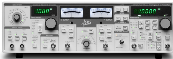
SR2124 front panel

For remote interfacing with complete electrical isolation, there is a rear-panel fiber optic interface. When connected to the SX199 Remote Computer Interface Unit, this provides a path for controlling the the lock-in via GPIB (IEEE-488.2), Ethernet, and RS-232.